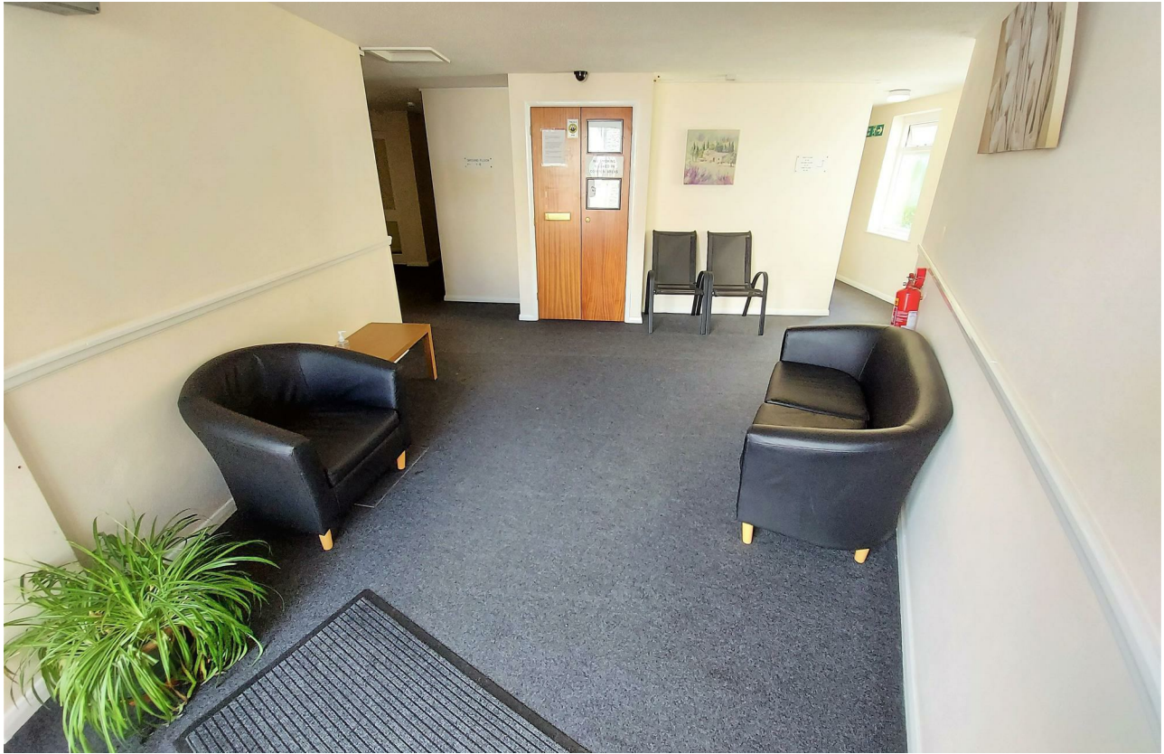
Society on the right hand side. The entrance to Market Court will be identified a short distance down on the right hand side.